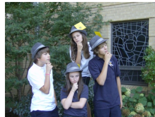
The Newsies Staff