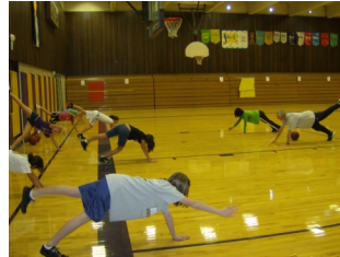
Photos taken during basketball practice.